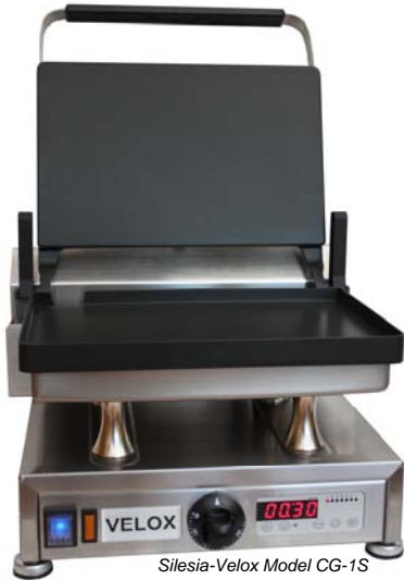
Silesia-Velox Model CG-1S