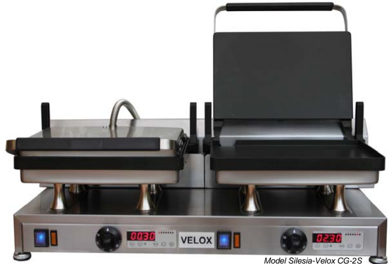
Model Silesia-Velox CG-2S